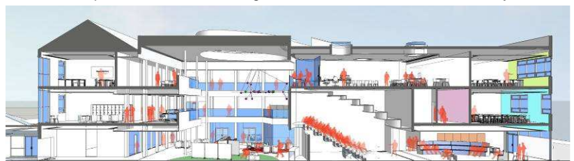
Internal Section through Agora and Lecture Theatre/Demonstration Suite