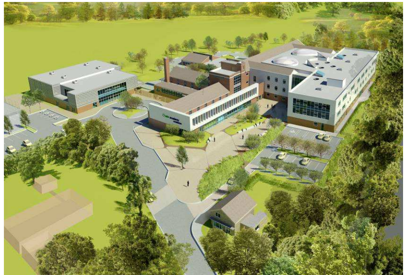
Aerial View from Main Entrance

Architects: Architects Co-Partnership Structural Eng: BDP M&E Consultants: BDP Landscape Arch: EDCO Contractor: Kier London