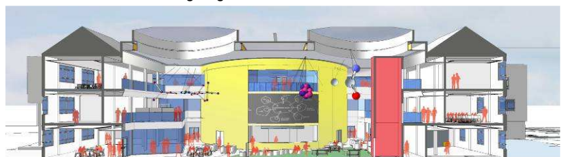
Internal Section through Agora