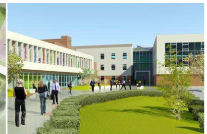
Main Entrance and 'Academy Mall'