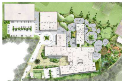
Landscape and External Learning